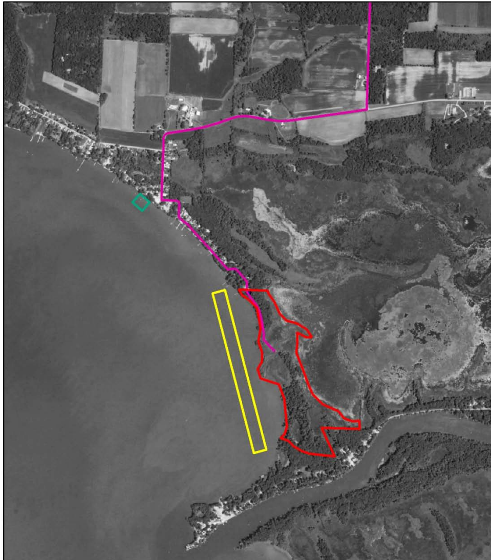
Enclosure 2 - Lake Koshkonong Dredge Location and APE