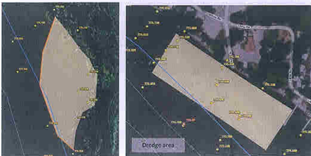
Figure 25: Breakwater Containment (left) and Dredge Area (right)