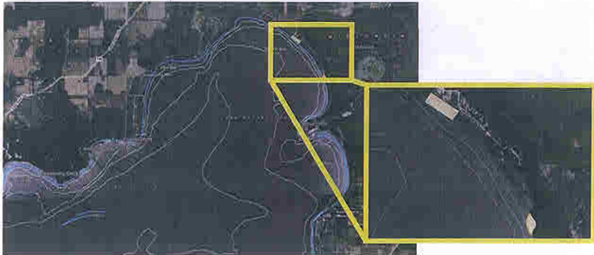
Figure 24: Locations- Stinkers Bay